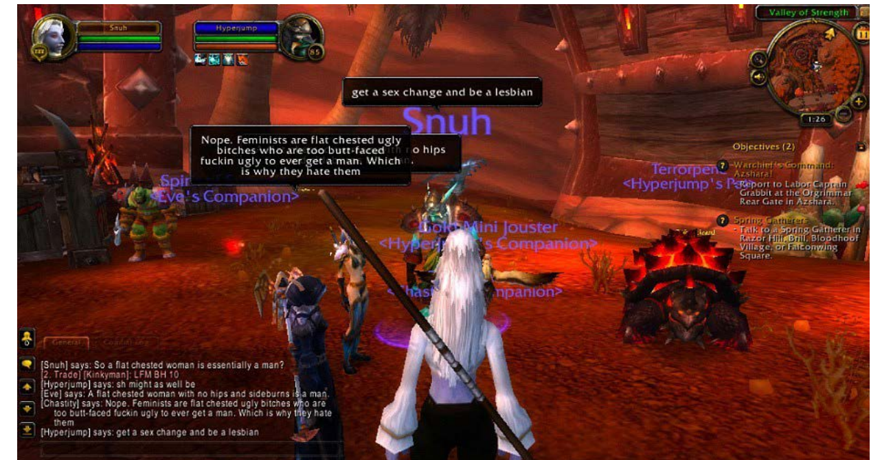
Fig 7. Screenshot of The Council on Gender Sensitivity and Behavioral Awareness in World of Warcraft (Washko, 2012)

Critical interventions like these may be especially useful in the context of Indonesia, where the world of gaming takes us back to the meatspace of the warnet . In recent years, the warnet has evolved into becoming sites for the modern LAN party, favoured by young boys and men in particular who gather there to play sessions of online games like DOTA and League of Legends . In this gendered space, a feminist tactical intervention or social